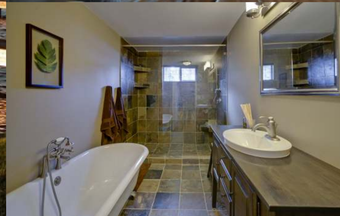
Exceptional lakefront value in this amazing home steps to the lake on this gorgeous level lakeshore lot. Located in the desirable upper Mission walking distance to two estate Wineries and one of Kelowna's few waterfront dog friendly parks. Enjoy unobstructed lakeviews from every room. Finished to a high quality with function in mind. Large detached garage with room for your boat and toys. Breathtaking views from both master suites. Easy access to pristine waterfront and deep water moorage. Move in and enjoy.